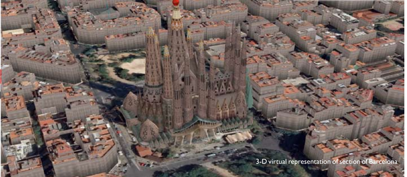
3-D virtual representation of section of Barcelona

ers' heads. This is no movie theater surround-sound: this sound transports viewers to the center of a tropical downpour.