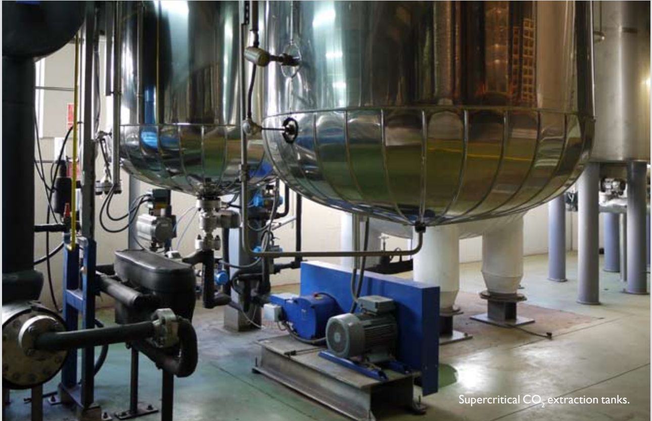
Supercritical CO 2 extraction tanks.